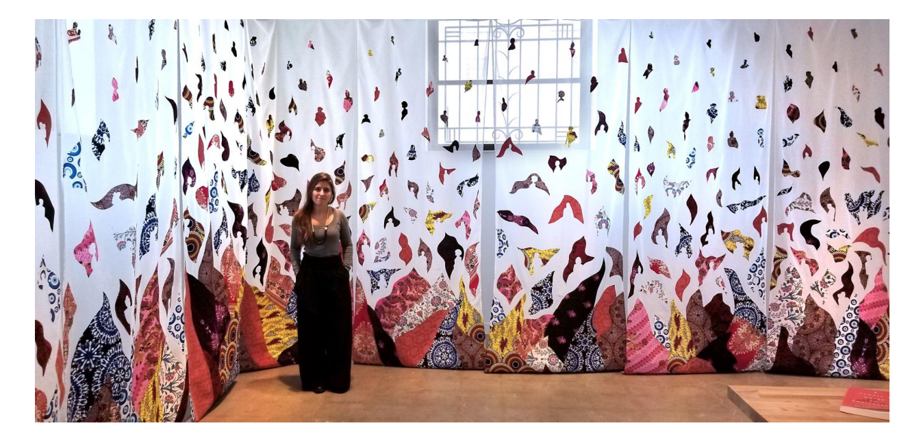
Igniting A Movement , Textile installation 8 panels of 4'x10' each. Me in front of my work.